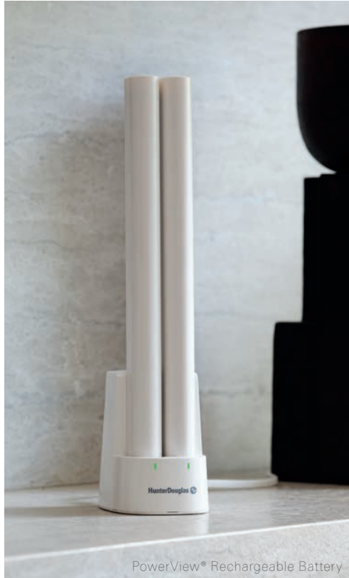
PowerView® Rechargeable Battery

Hunter Douglas PowerView® shades are available with a variety of power options, including a rechargeable battery and hardwiring capability. 1